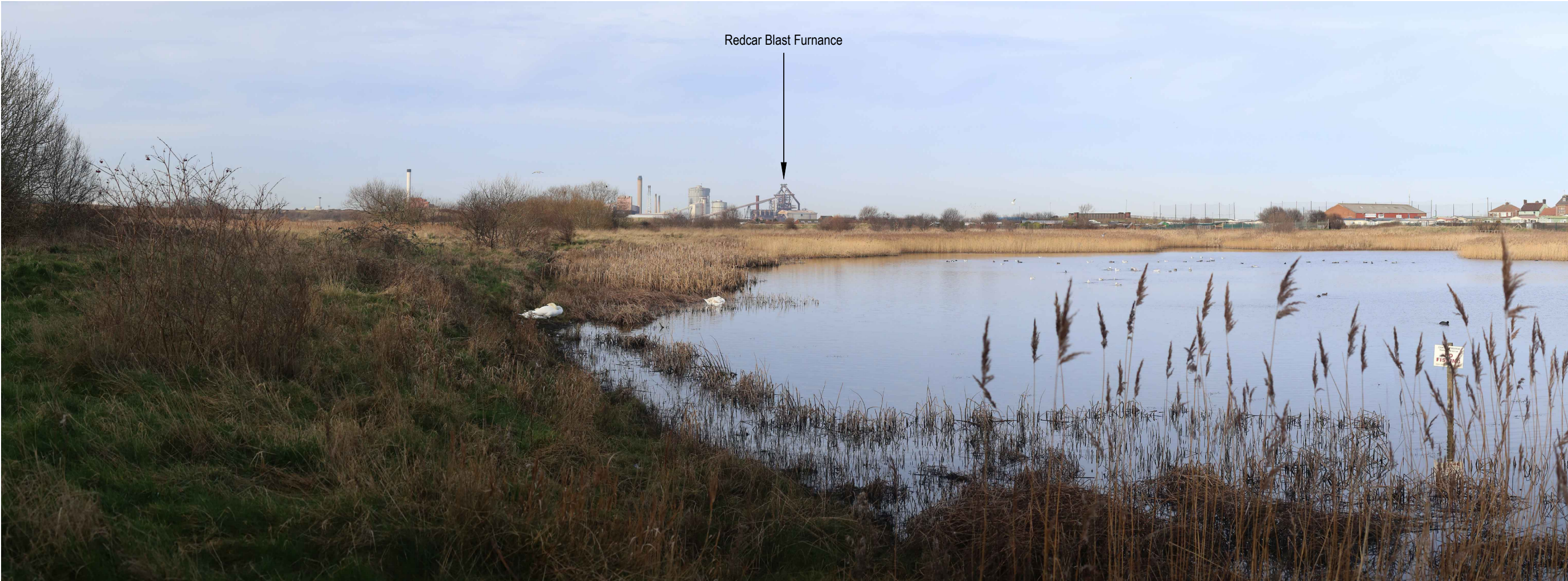
Extent of 50mm single frame image

This image provides landscape and visual context only